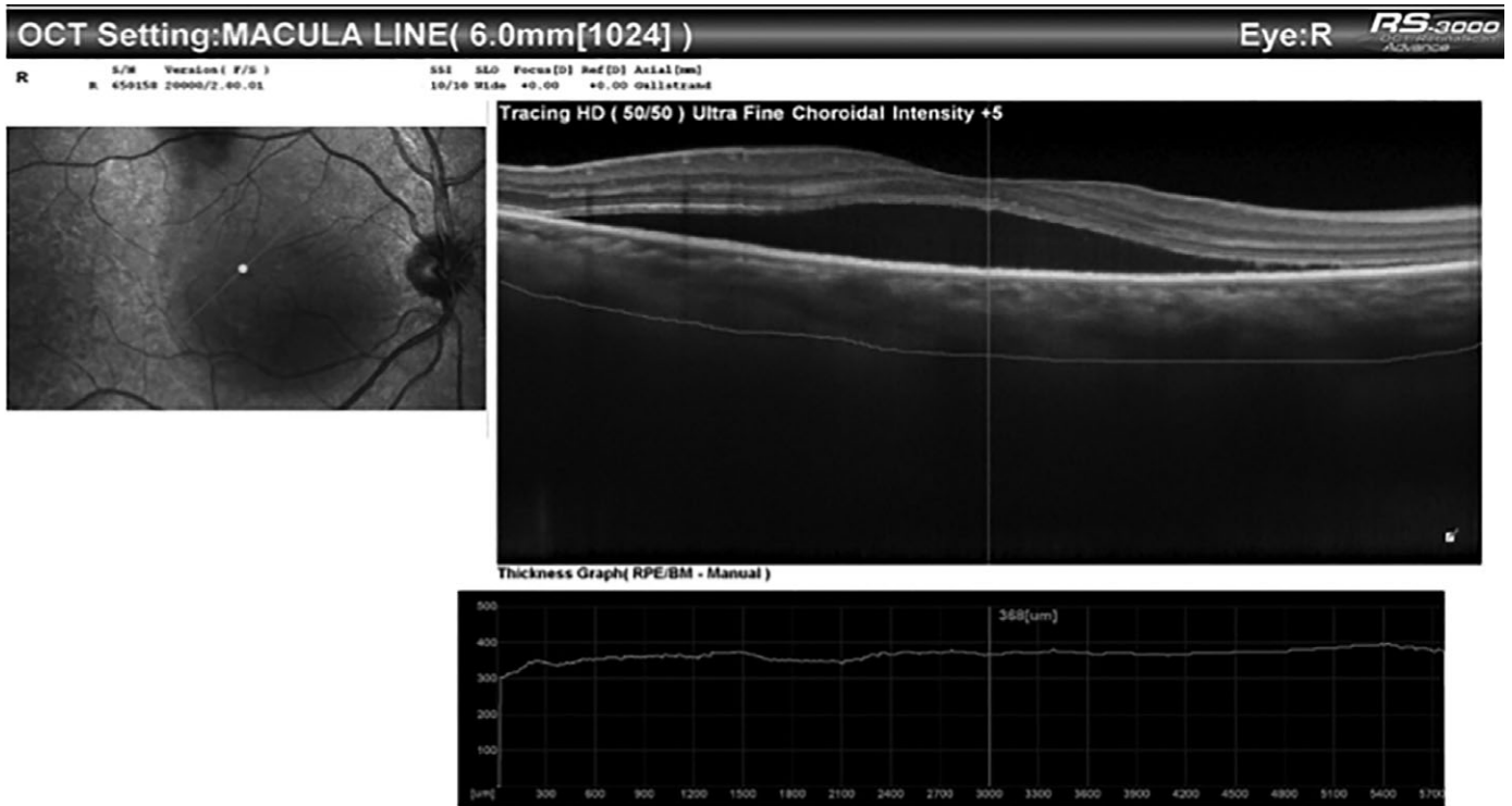
Figure 1. A: Right eye of a patient showing neurosensory detachment (NSD) at baseline